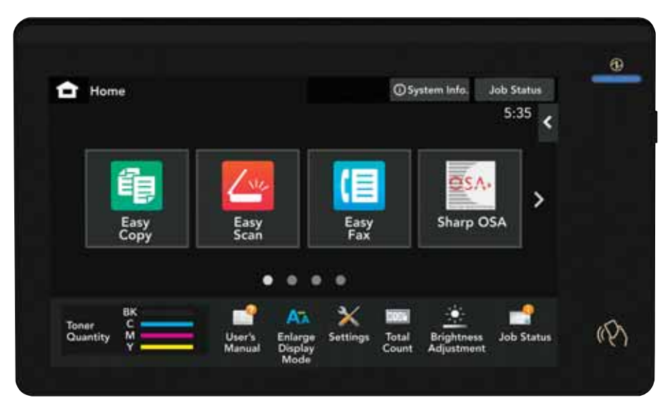
10.1" (diagonally measured) customizable touchscreen display.