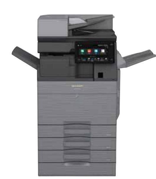
BP-70C65 shown with Inner Folding Unit, Right Side Exit Tray and 2-drawer Paper Deck.