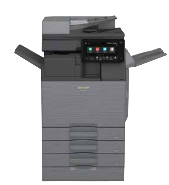
BP-50C45 shown with Inner Folding Unit, Right Side Exit Tray and 2-drawer Paper Deck.