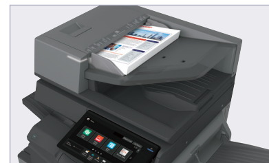
High capacity 300-sheet DSPF scans documents at up to 280 images per minute.