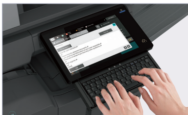
Built-in retractable keyboard simplifies email address and subject line entries.