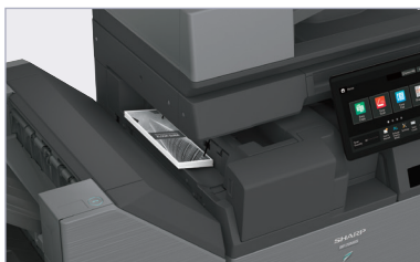
New Inner Folding Unit option offers a variety of fold patterns, including tri-fold, z-fold and others.