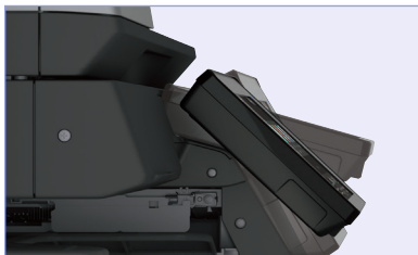
Pivoting Touchscreen offers the viewing angle for any use instantly.