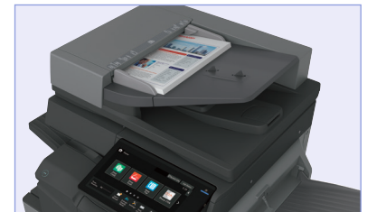
100-sheet RSPF scans documents at up to 80 images per minute.