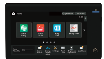
10.1" (diagonally measured) customizable touchscreen display.