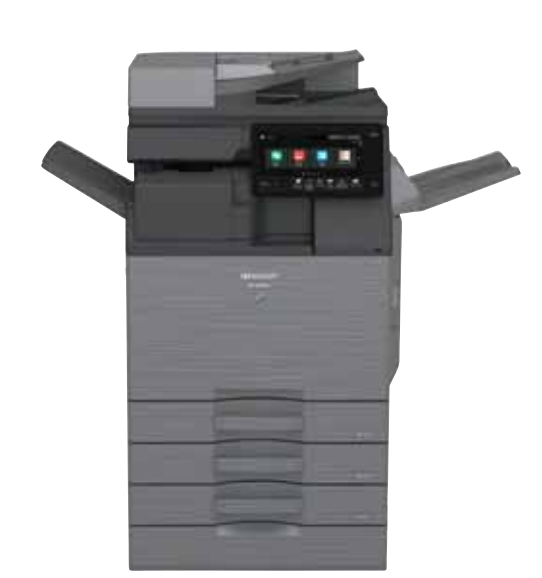
BP-50M45 shown with Inner Folding Unit, Right Side Exit Tray, and 2-drawer Paper Deck.