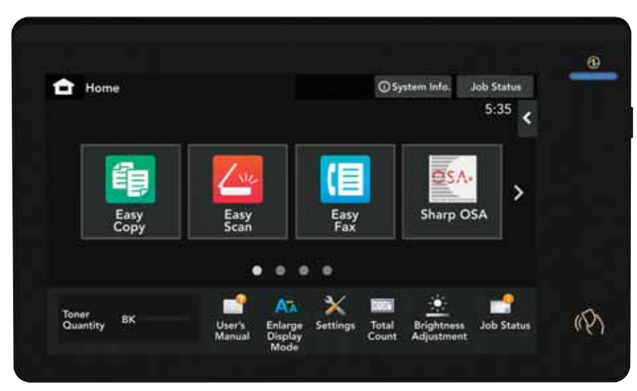
10.1" (diagonally measured) customizable touchscreen display.