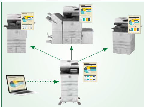
With Serverless Print Release you can securely print a job and release it from up to six Sharp MFPs (including host).