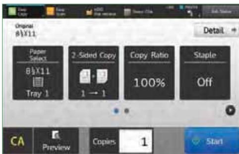
Easy Mode Copy Screen.