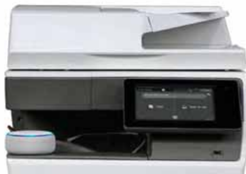
MX-C304WH shown with available Sharp MFP Voice feature with Alexa.

"Alexa, ask Sharp Copier to scan to me."