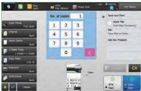
Standard Copy Screen offers more advanced features.