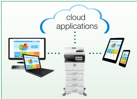
Distribute, access and print documents more easily.