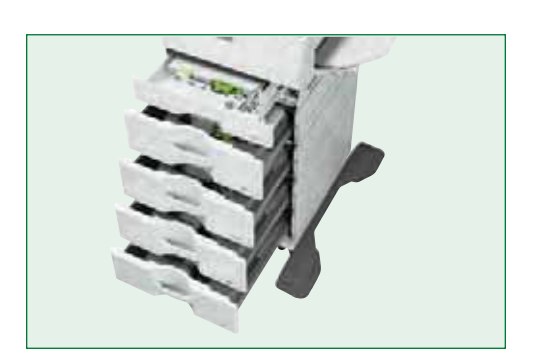
Both models offer up to six paper sources for a maximum 2,700-sheet capacity (shown with optional trays).