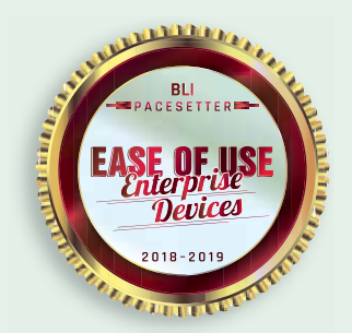
"PaceSetter Award in Ease of Use 2018–2019"