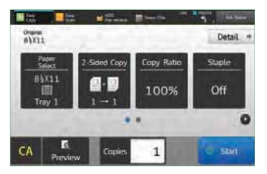
Easy Mode Copy Screen.