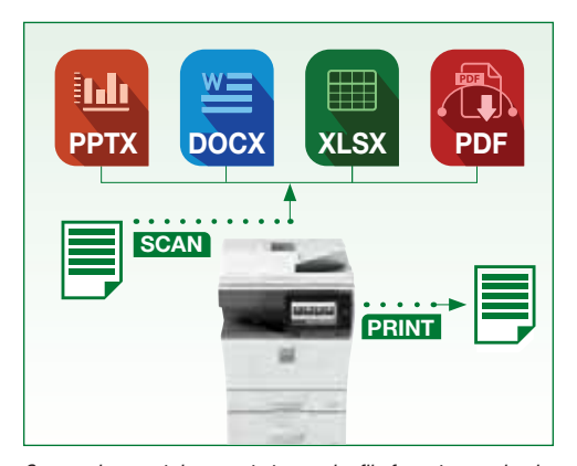
Scan and convert documents to popular file formats seamlessly with the Sharp built-in OCR function <sup>2</sup>.