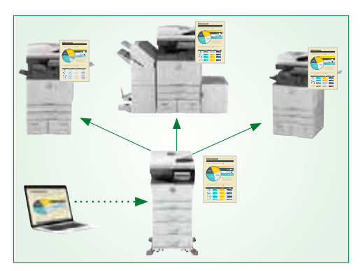
With Serverless Print Release you can securely print a job and release it from up to six Sharp MFPs (including host).