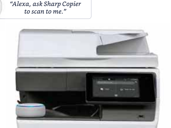
MX-C304WH shown with available Sharp MFP Voice feature with Alexa.

Sharp has always been known for enhancing MFP productivity in the workplace by offering innovative, easy-to-use features. Sharp has done it again with the MFP Voice feature available for color document systems. With the Sharp MFP Voice feature, you can interact with the machine just by using the power of natural language. With simple voice commands, you can ask the Sharp MFP to make copies or scan a document.