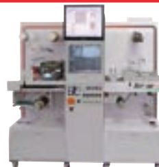
ArrowCut Nova 250R