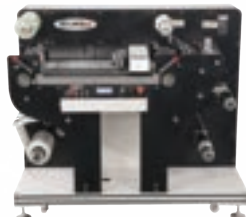
Arrow EZCut 330R