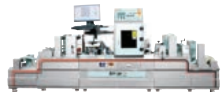
ArrowCut Nova 330R