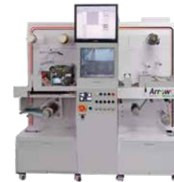
ArrowCut Nova 250R