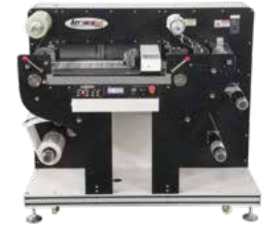
Arrow EZCut 330R